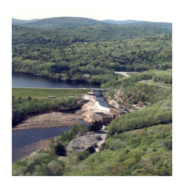
EJ West Hydropower Plant