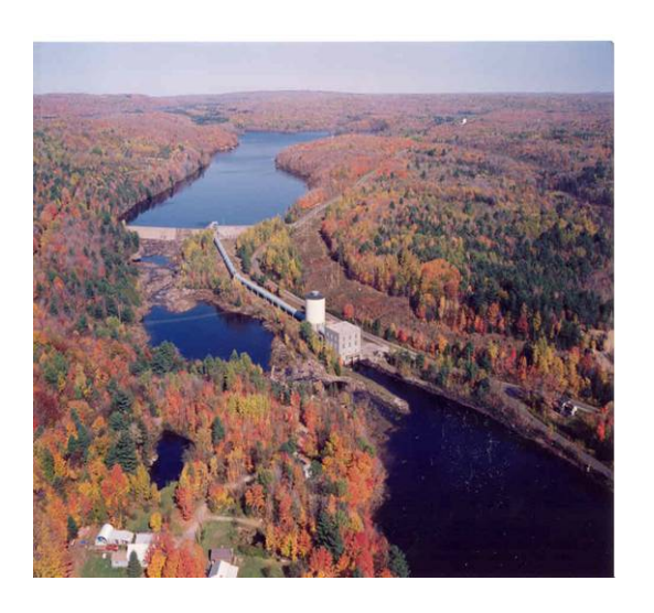
South Colton Hydropower Plant